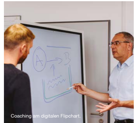
Coaching am digitalen Flipchart.