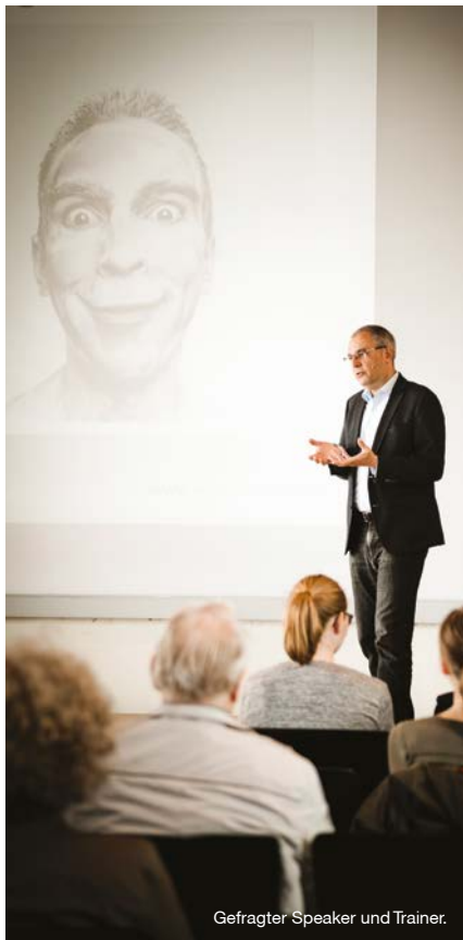
Gefragter Speaker und Trainer.